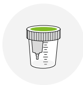
Urine Testing 1-14 days in the system (drug dependant & can be longer)