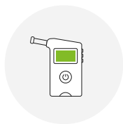
Breath Alcohol Test Immediate - Legally defensible/ evidential